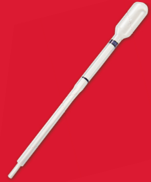
PTS Collect Capillary Tube 40 µL Sample Volume Results for all available sizes fall between low and high tolerances